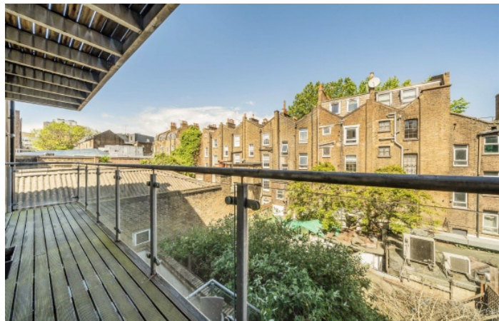
Acton Street, WC1X