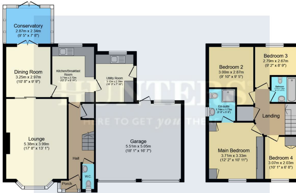
Ground Floor Floor area 96.5 sq.m. (1,039 sq.ft.)