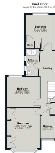
Total area: approx. 173.9 sq. metres (1871.9 sq. feet) St Marks Rd