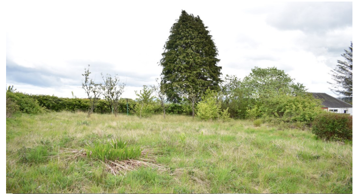
33 Erskine Place