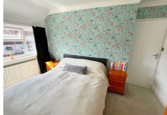
Bedroom One 12'5" x 8'11" (3.80m x 2.72m)