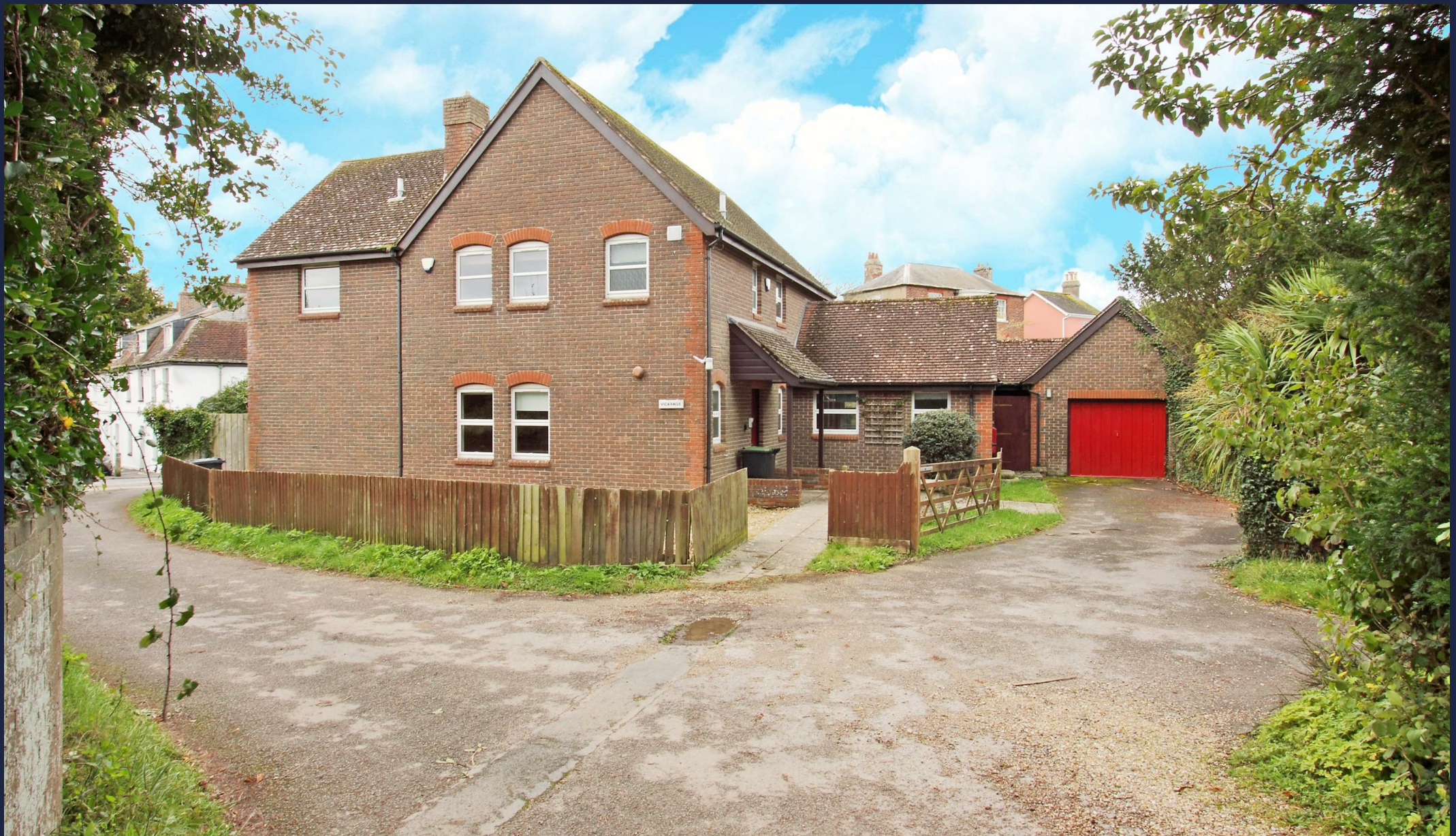
St George's Vicarage, 59 High Street, Dorchester