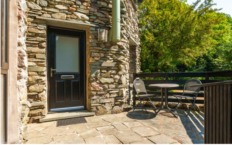
Private Patio Terrace