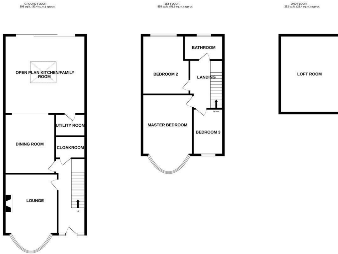
3 BEDROOM EOT HOUSE

TOTAL FLOOR AREA : 1706 sq.ft. (158.5 sq.m.) approx.