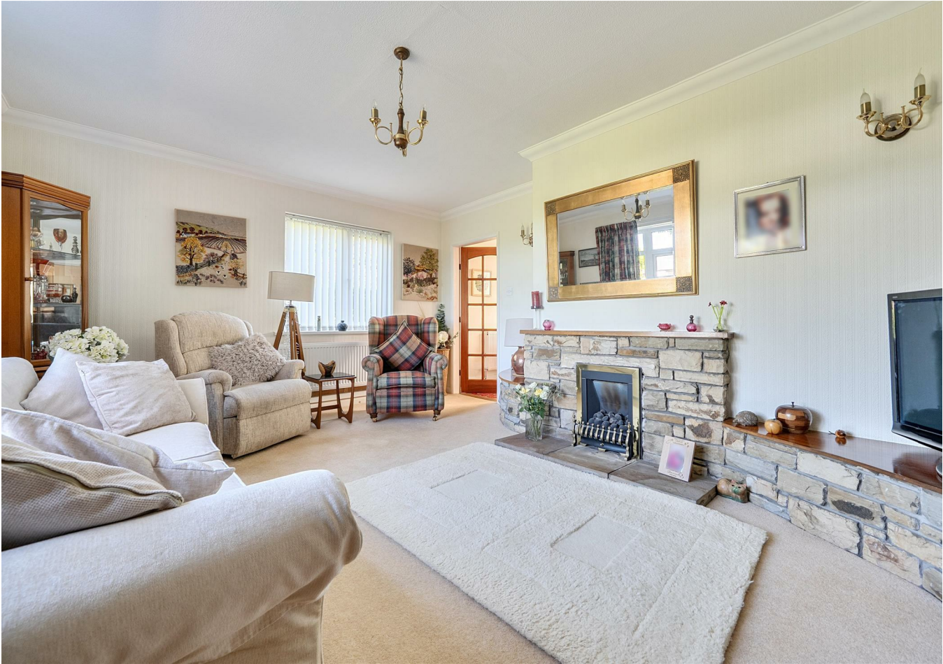
Red House Dearham Bridge Road, Maryport