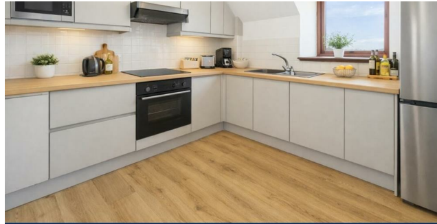
Kitchen virtually dressed in

Whilst the foregoing particulars are believed to be correct they are issued for the guidance of interested parties only. Measurements in particulars are only approximate and floorplans are indicative only and not to scale. The sellers do not bind themselves to accept any or the highest offer. The sellers reserve the right to accept a suitable offer at any time without setting a closing date. A closing date for offers may be fixed and prospective purchasers are advised to have their interest noted through their solicitor to the selling agents. Any formal offer should be made in writing through a Scottish solicitor, sent to our Dingwall office and emailed to property@highlandhomes.co.uk . Floor coverings, curtains, blinds and kitchen appliances are included in the sale. The mention of appliances and services does not imply that they are in full and efficient working order.