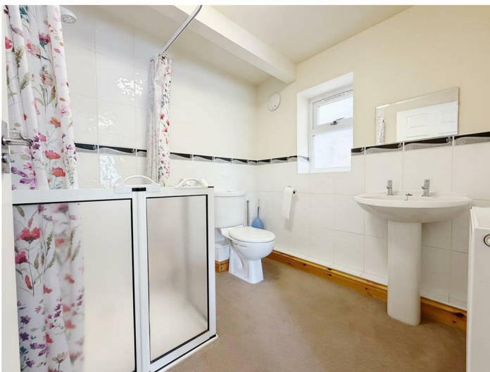
ANNEX SHOWER ROOM

Fitted with a low-level WC, pedestal wash hand basin, and a low-base corner shower enclosure with electric shower. Partially tiled walls, an opaque window to the side elevation, and a radiator.