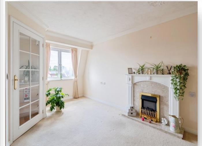
Castle Lodge Gladstone Road, Chippenham SN15 3YY