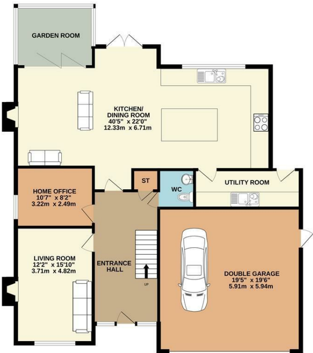
GROUND FLOOR 1592 sq.ft. (147.9 sq.m.) approx.