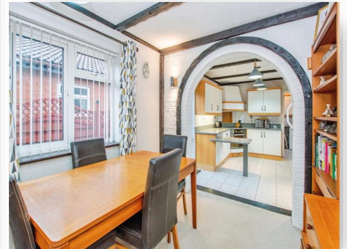
Tapend, Church Road, Emneth, Wisbech, PE14 8AA