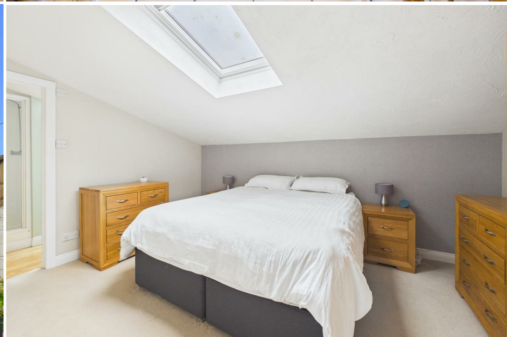
Trelissick Road, Hayle, TR27 4HY