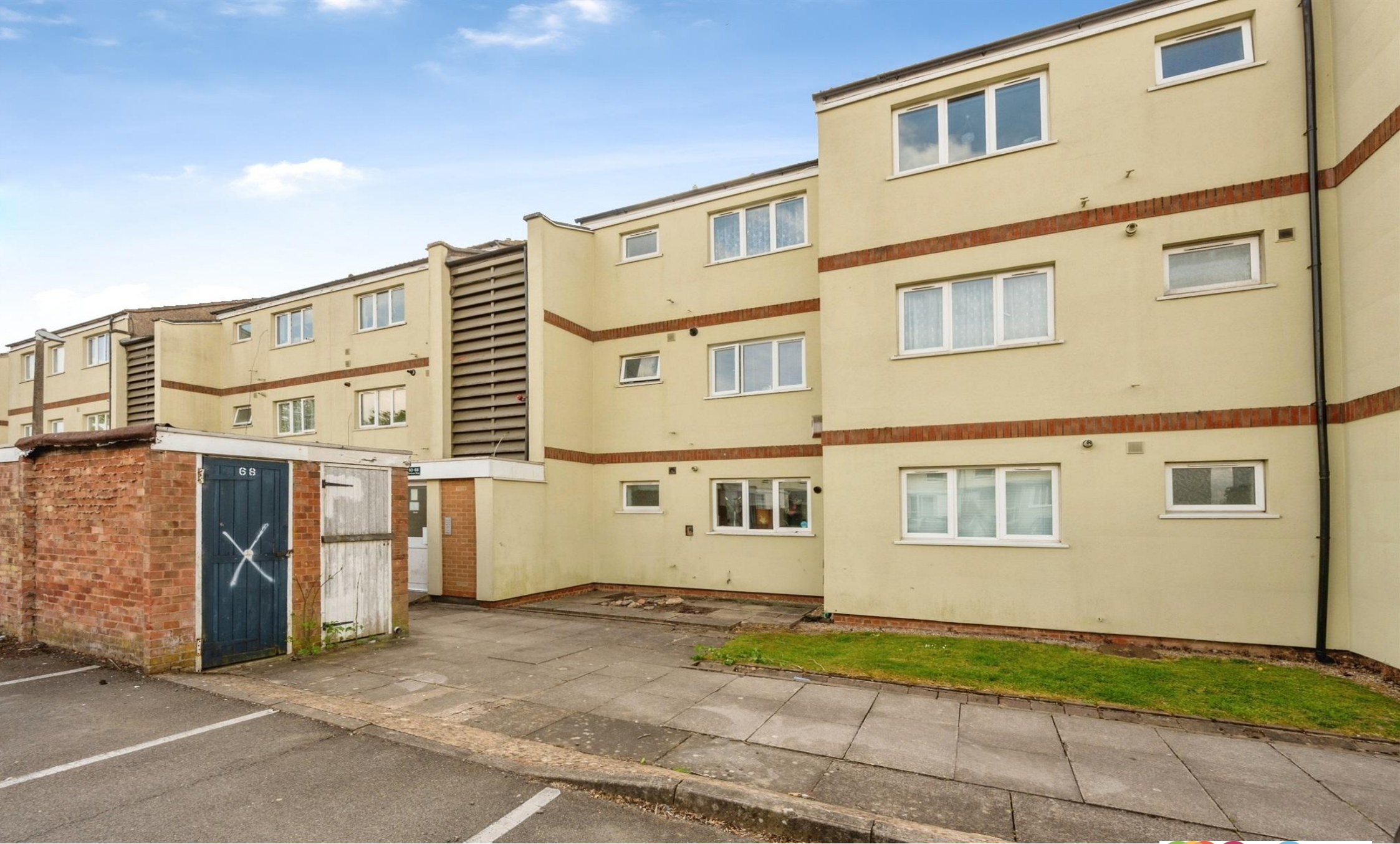
Fownhope Close, Redditch B98 0LA