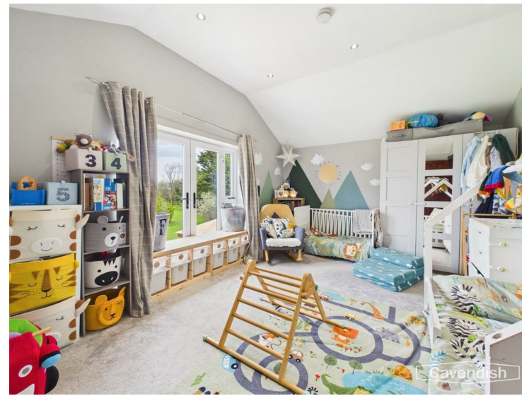
BEDROOM 2 5.08m x 3.66m (16'8" x 12')

uPVC double glazed French doors with double glazed side windows, part-vaulted ceiling with recessed LED ceiling spotlights, mains connected smoke alarm and double radiator with thermostat.