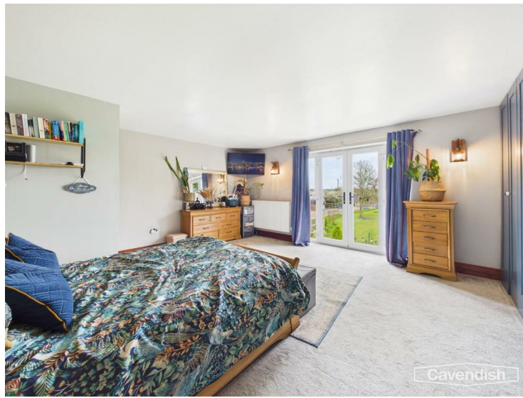
PRINCIPAL BEDROOM 4.67m x 4.88m to front of wardrobes (15'4" x 16' to front of wardrobes)

Fitted with a range of five double wardrobes to length of one wall having hanging space and shelving, uPVC double glazed French doors with full height windows to each side, two wall light points, double radiator with thermostat, and provision for wall mounted flat screen television. Door to En-suite Shower Room.