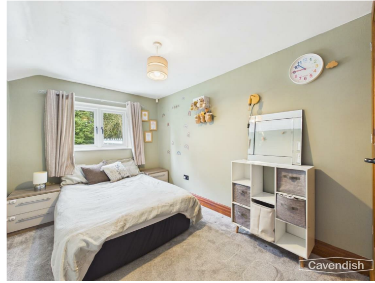
BEDROOM 3 4.09m x 2.44m (13'5" x 8')

uPVC double glazed window to the side, single radiator with thermostat, ceiling light point and built-in wardrobe with hanging rail and shelf.