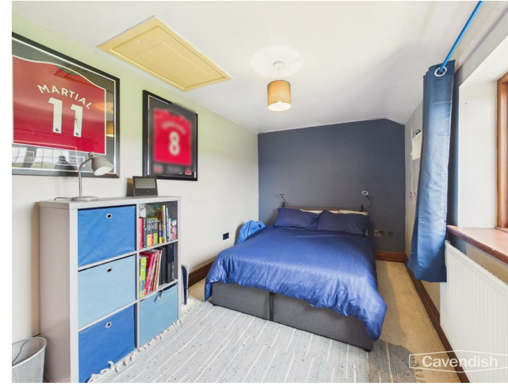
BEDROOM 4 4.19m x 2.44m (13'9" x 8')

Sealed unit double glazed leaded window overlooking the front with views over surrounding farmland, access to loft space, ceiling light point, single radiator with thermostat and built-in wardrobe with hanging rail and shelf.