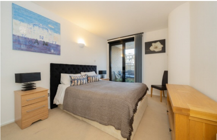
Cromwell Road, SW7