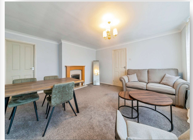
Bellmond Close, Newark NG24 4ER