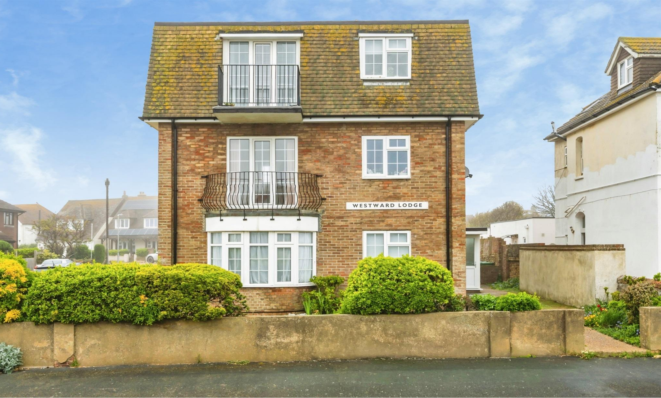
Westward Lodge Claremont Road, Seaford BN25 2QD