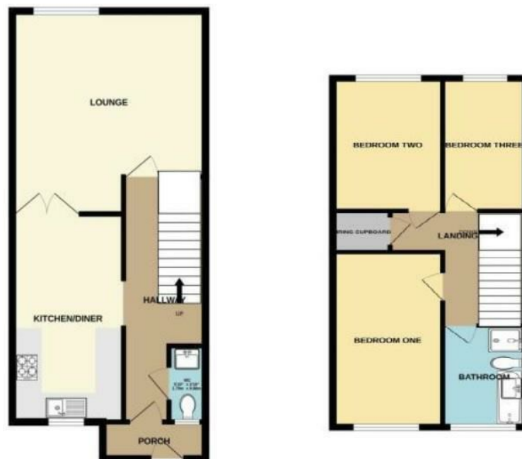
3 BED 3RD TERRACE

Whilst every effort has been made to ensure the accuracy of the floorplan contained herein, measurements of rooms, corridors, stairs and any other parts are approximate and no responsibility is taken for any errors, omissions, misprints or any other errors. This plan is for illustrative purposes only and should not be used for any prospective purchase. The services, systems and appliances shown have not been tested and no guarantee is given as to their operation or efficiency save for those shown with the manufacturer's logo.