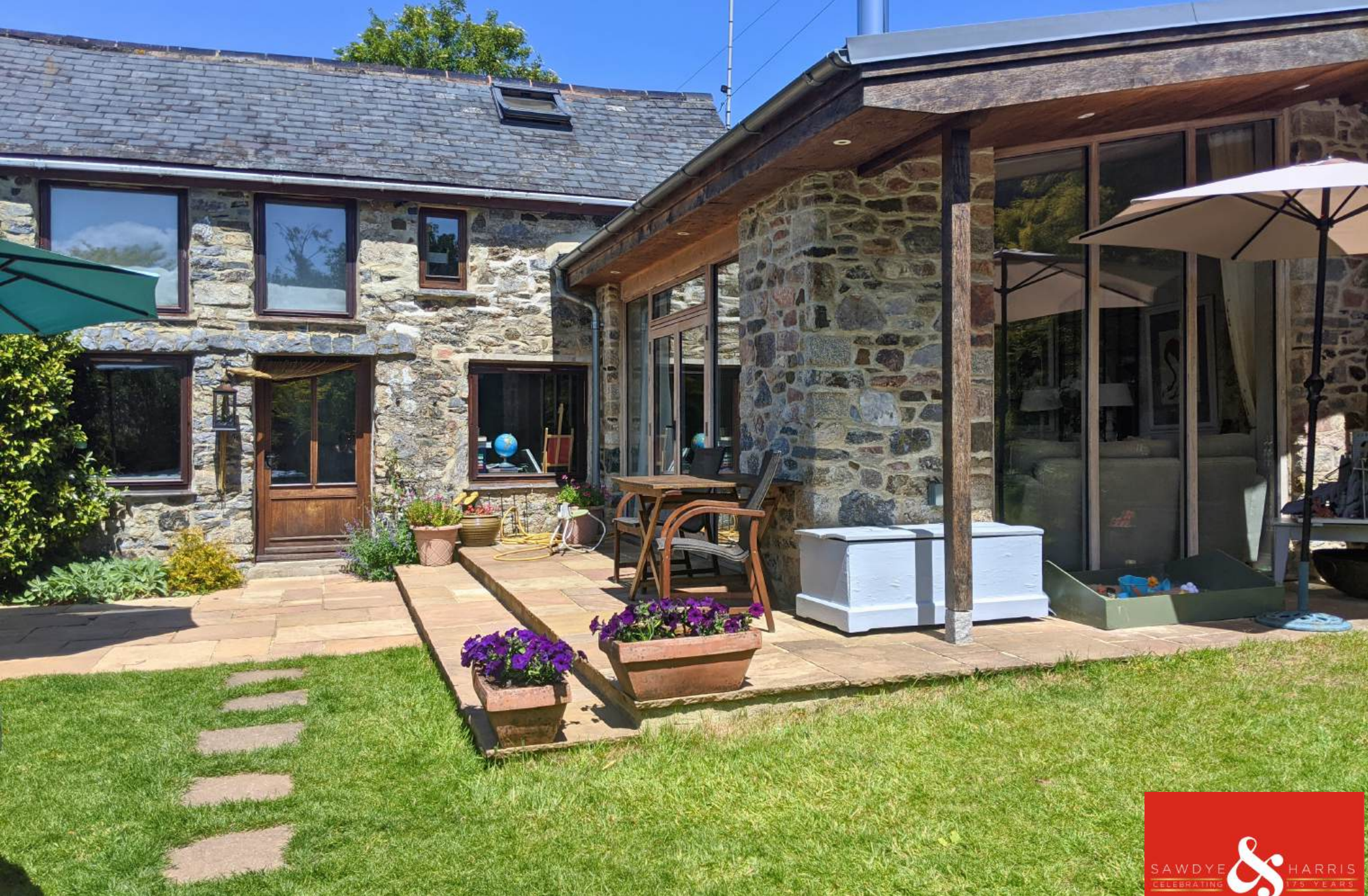
OLD BARN, REW ROAD, ASHBURTON