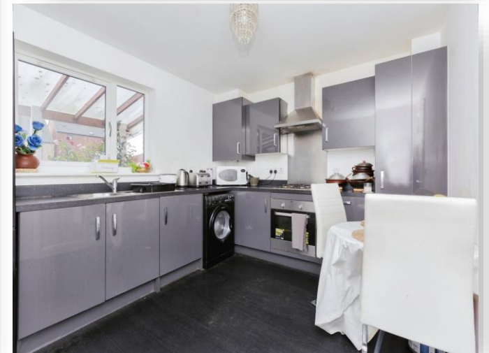
Mckay Avenue, Leicester LE4 5FD