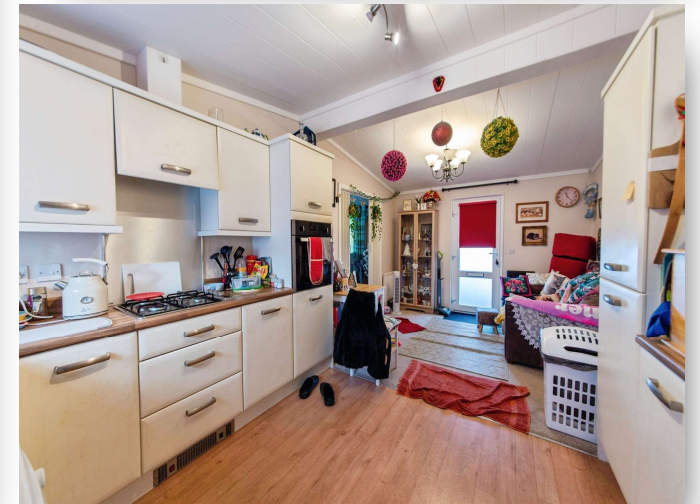
Riverbank Close Marina View, Dogdyke Lincoln LN4 4UJ