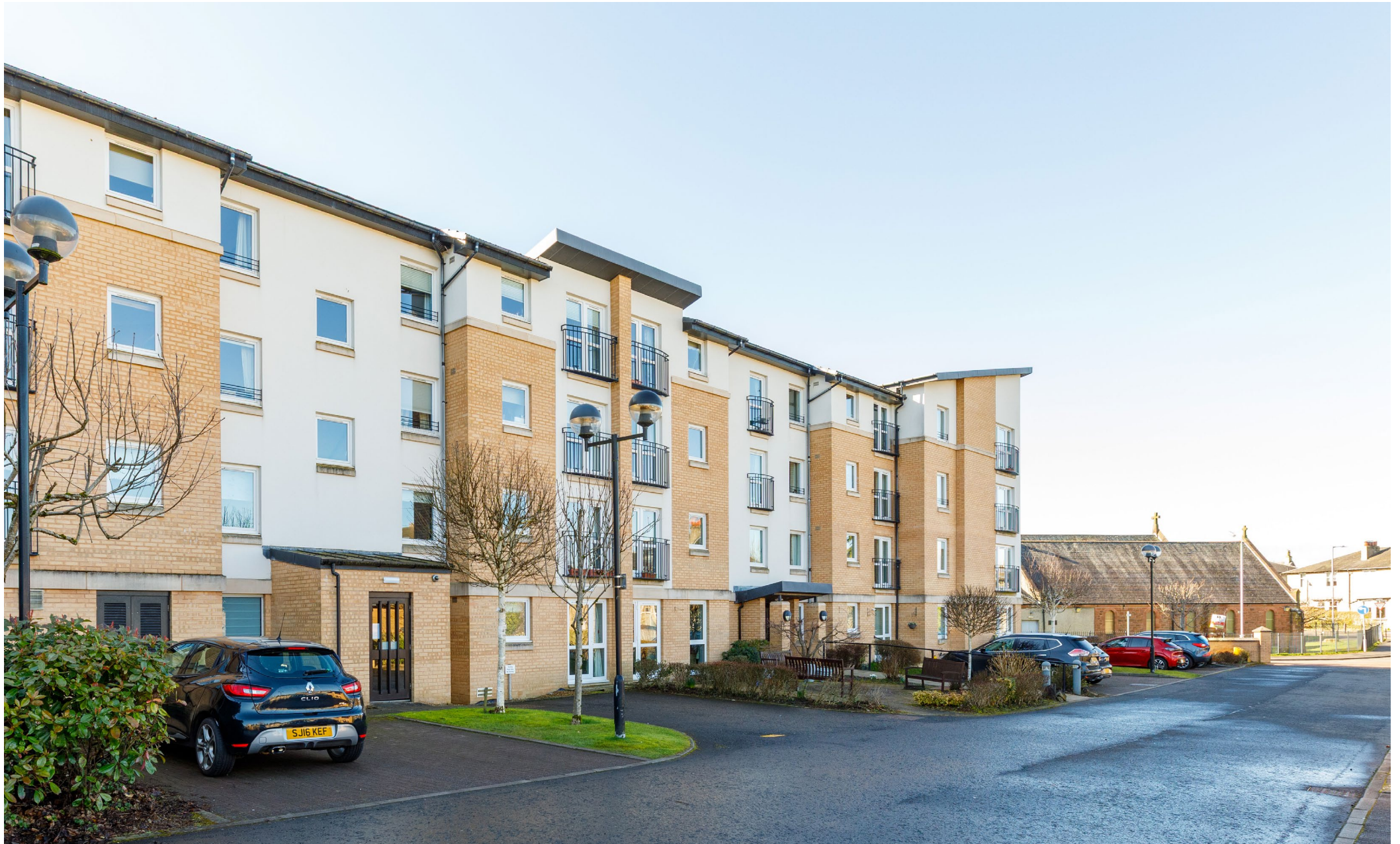
Apartment 18 Aidans View, 1 Aidans Brae, Clarkston G76 7EP www.nicolestateagents.co.uk