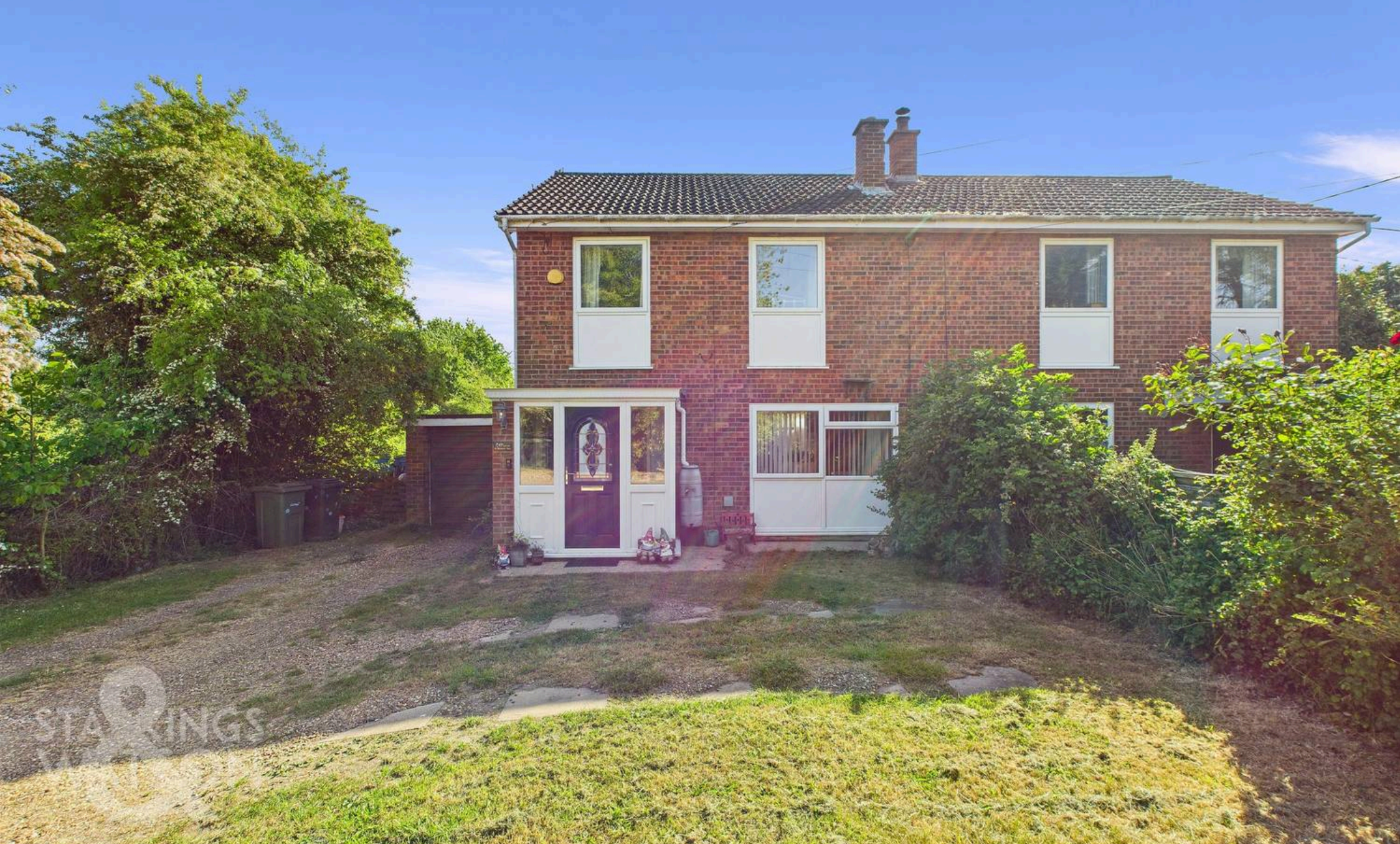
St. Michaels View, Flordon - NR15 1RR