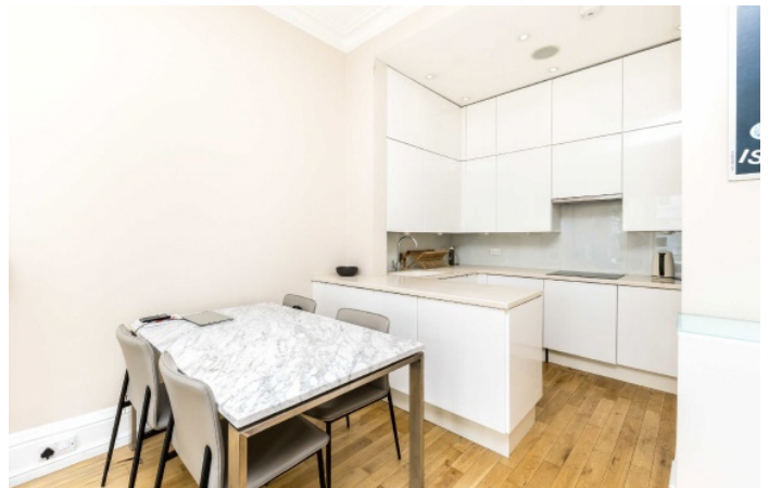
Holland Park, W11