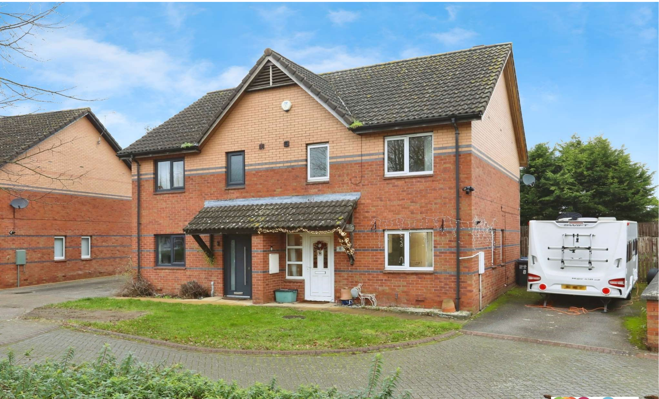
Shining Cliff Court, Bawtry Doncaster DN10 6SW