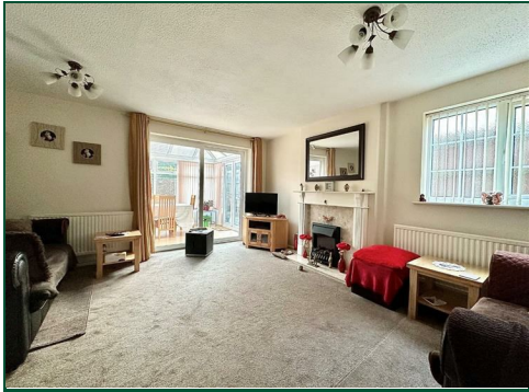
GROUND FLOOR 477 sq. ft. (44.3 sq. m.) approx.