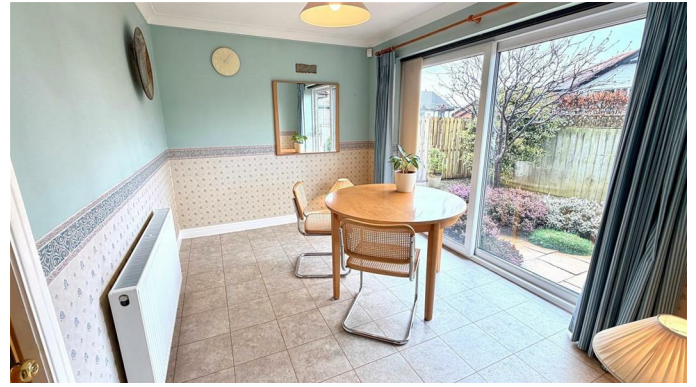
BREAKFAST/MORNING/SUN ROOM 11'10" x 8'3" (3.63m x 2.54m)