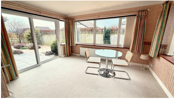
DUAL ASPECT DINING AREA 13'4" x 9'10" (4.08m x 3.01m)

Coving, double radiator, upvc double glazed windows and upvc double glazed sliding patio door to rear garden.