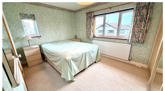
DUAL ASPECT BEDROOM 1 13'6" x 9'3" (4.14m x 2.84m)

Upvc double glazed windows with deep display sill, airing cupboard with slatted shelving.