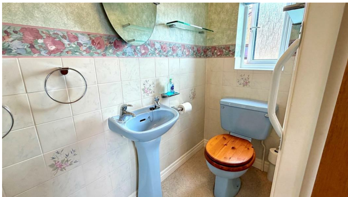
Coloured suite comprising tiled shower stall with 'Mira' shower, pedestal wash hand basin, close coupled wc, display shelving, upvc double glazed windows.