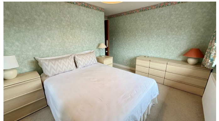
Radiator, dual aspect upvc double glazed windows to rear and side, distant hillside views.