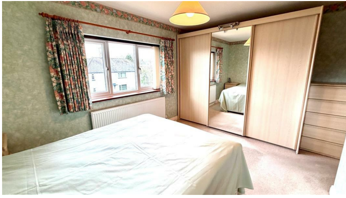
Access to roof space, radiator, dual aspect upvc double glazed windows.