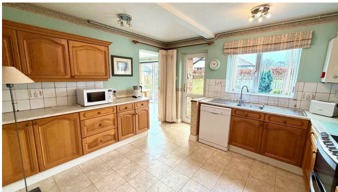
KITCHEN 12'3" x 11'6" (3.74m x 3.52m)

Coving, double radiator, upvc double glazed windows and upvc double glazed sliding patio door to rear garden.