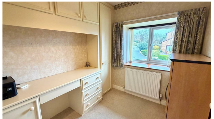
Including built in wardrobes, top cupboards, dressing table, radiator, upvc double glazed window to front with deep display sill.