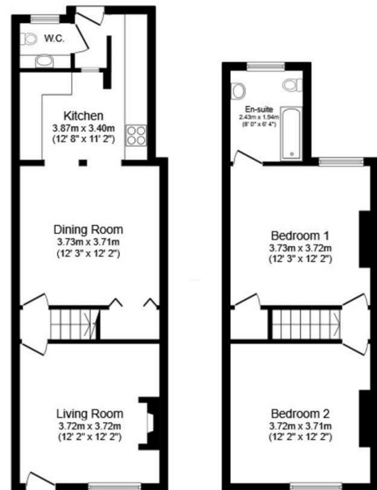
Ground Floor Floor area 44.8 sq.m. (482 sq.ft.)