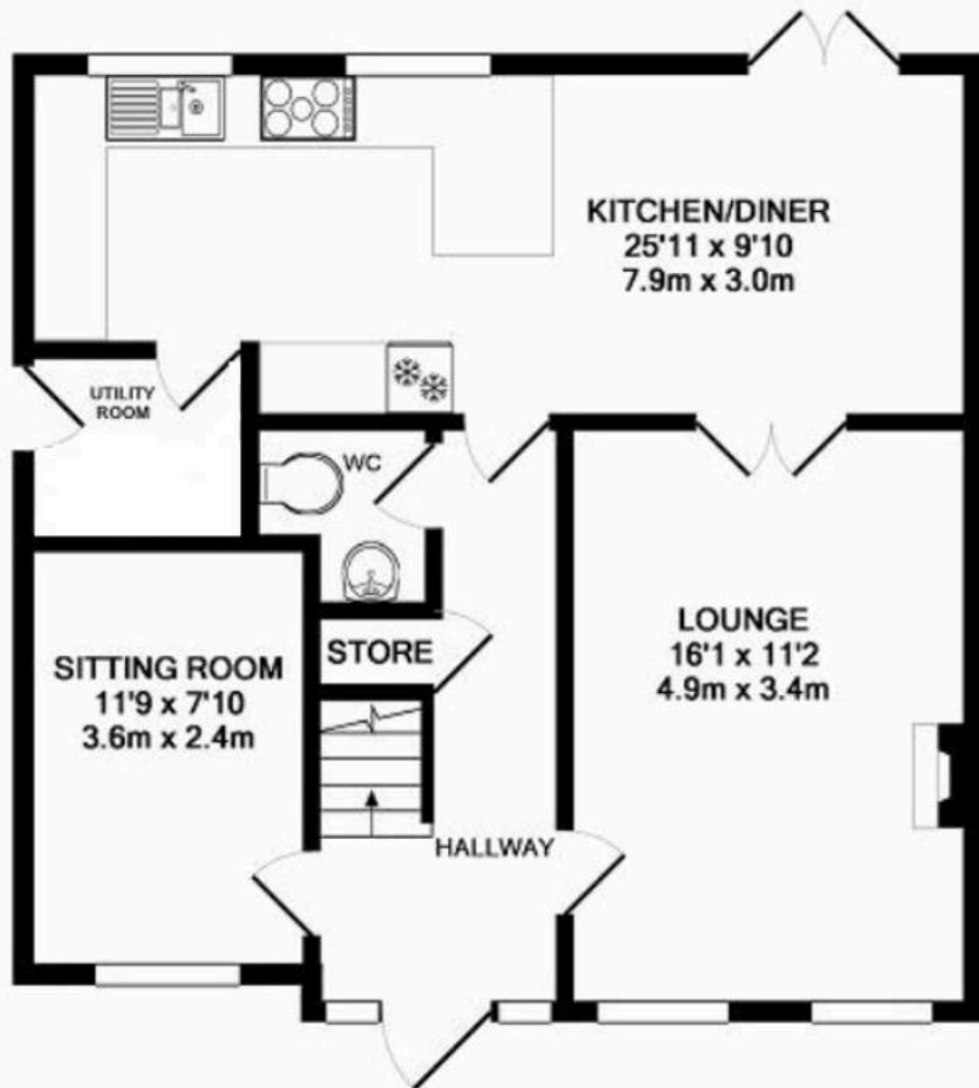
GROUND FLOOR APPROX. FLOOR AREA 663 SQ.FT. (61.6 SQ.M.)