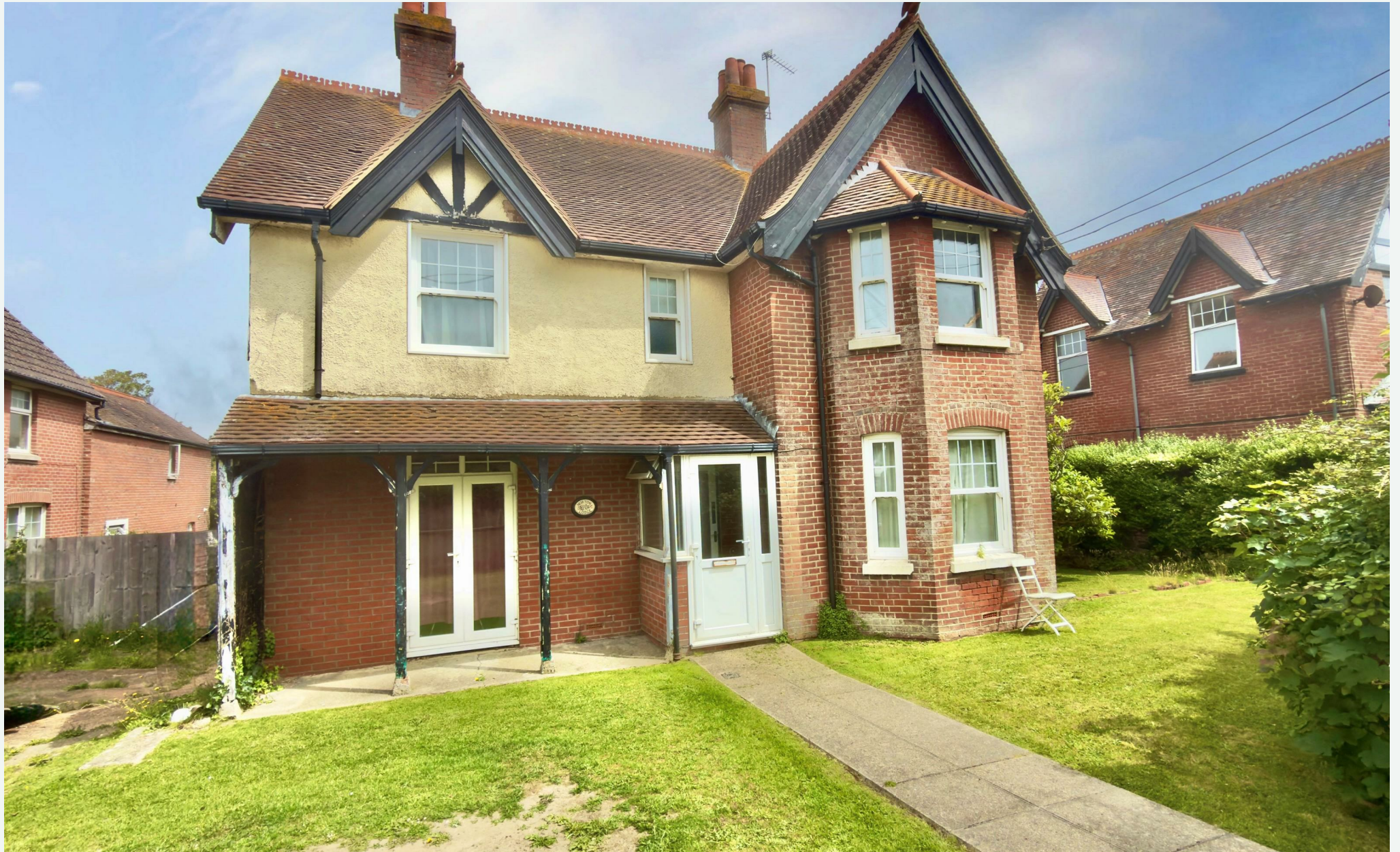
Norton Lodge, Granville Road, Totland Bay, Isle of Wight