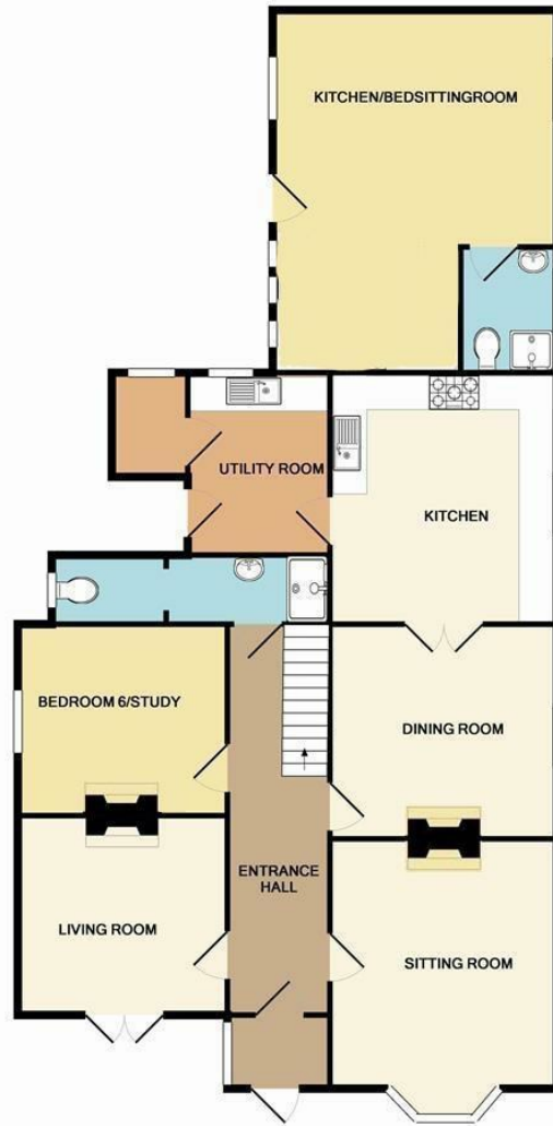
GROUND FLOOR APPROX. FLOOR AREA 1512 SQ.FT. (140.5 SQ.M.)