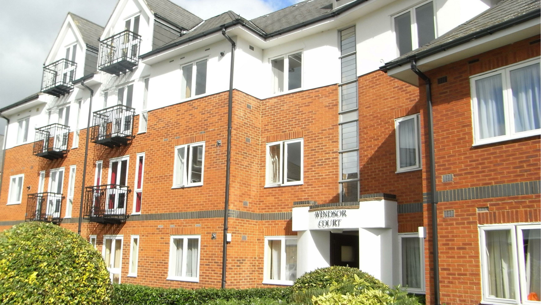
25 Windsor Court Park View Close, St Albans, Hertfordshire, AL1 5TT Asking Price £245,000