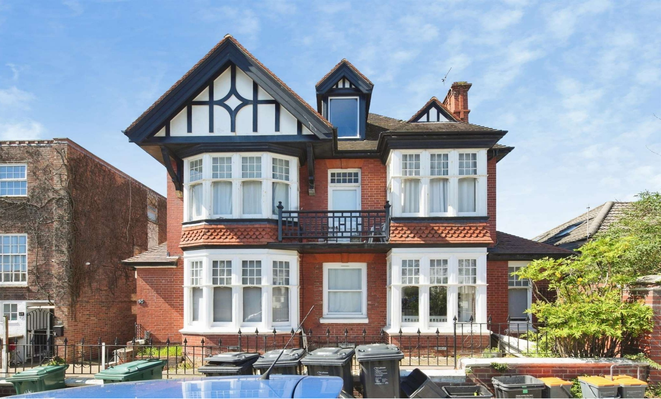
Fonthill Road, Hove BN3 6HD