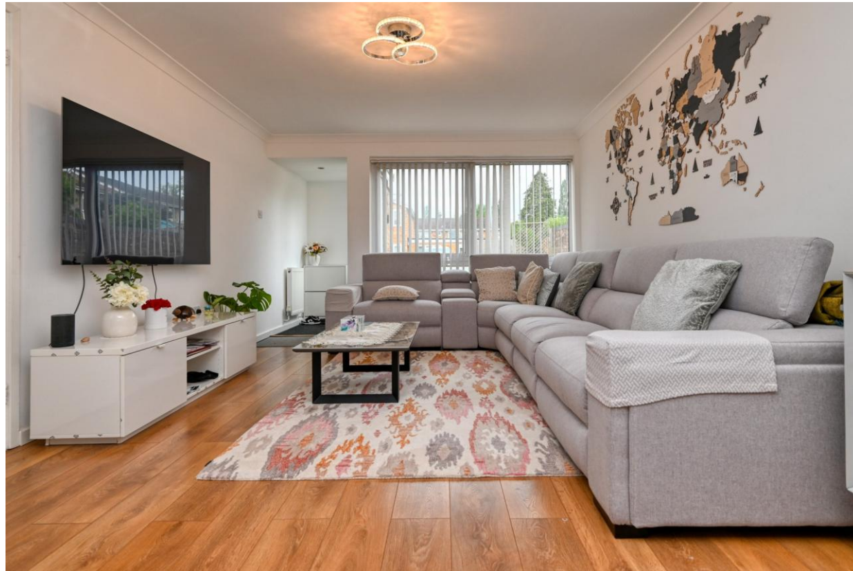
6 Redberry Close, Caversham Park, Reading, RG4 6QF O.I.E.O. £415,000 Freehold

Masons are proud to offer to the market this very well presented three bedroom semi-detached house, situated in Caversham Park and close to Caversham and Reading centres, along with Reading mainline station. Having undergone major improvements by its current owners the property offers a 25ft living/dining room, a modern 10ft kitchen, a newly added utility room, a 13ft master bedroom and new bathroom. Further benefits include two further double bedrooms, a private rear garden, off road parking for several cars and a 16ft garage. Viewing recommended.