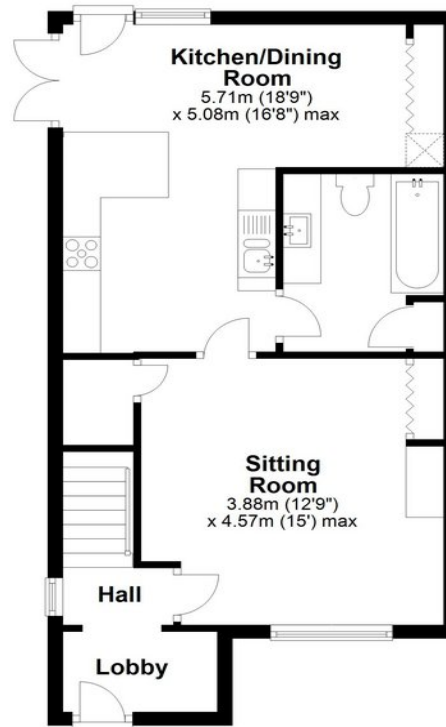
Ground Floor Approx. 49.7 sq. metres (534.5 sq. feet)