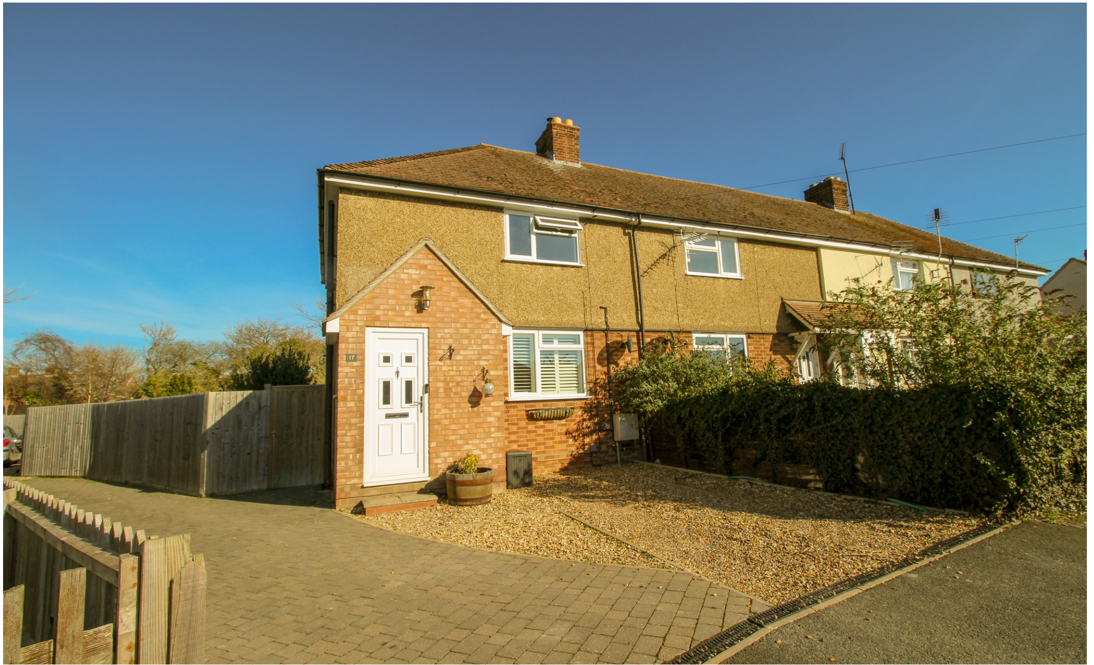
The Avenue, Burwell