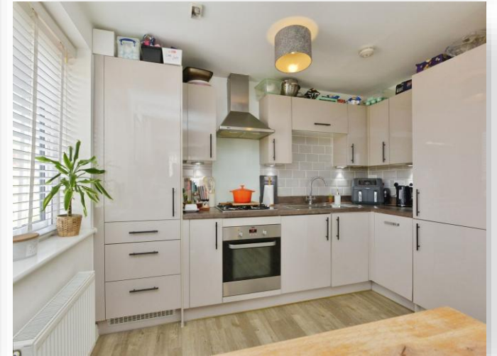
Flat 2 Cicero Crescent, Fairfields Milton Keynes MK11 4BR