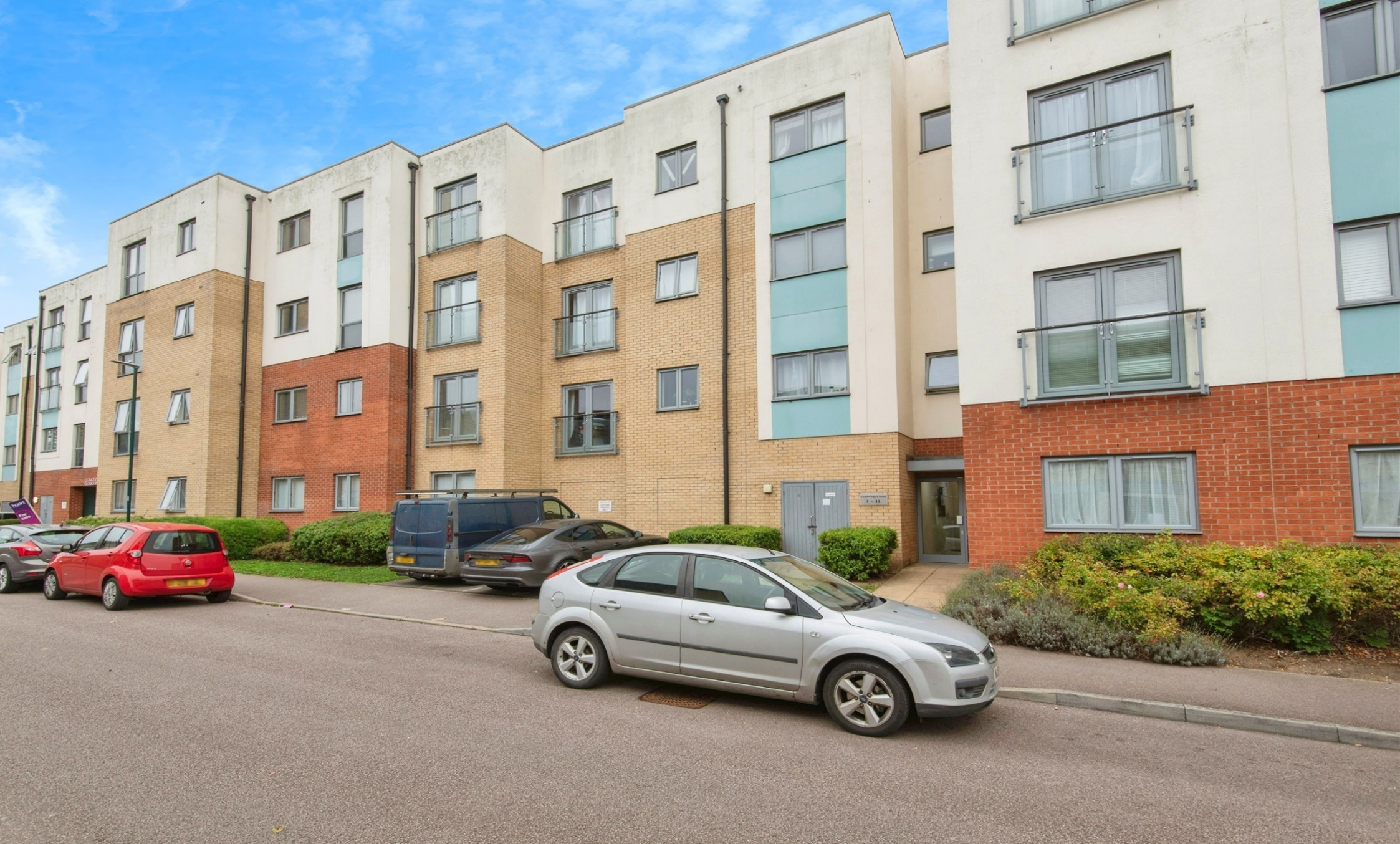
Leafwing Court Admiral Drive, Stevenage SG1 4GD