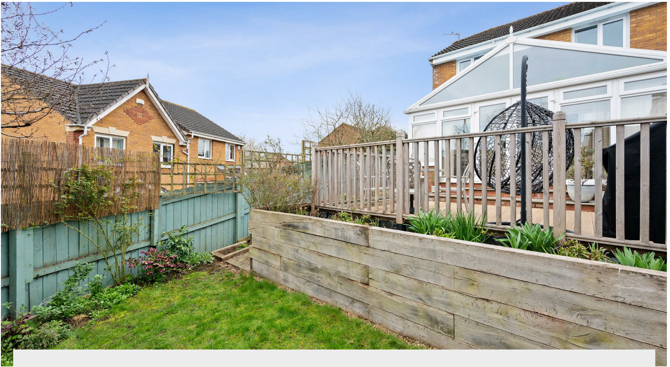
Landscaped Rear Garden With Decked Seating Area