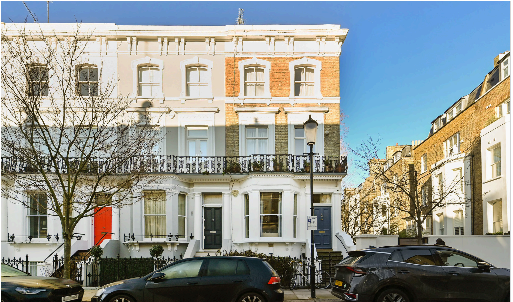
Fawcett Street, Chelsea, SW10