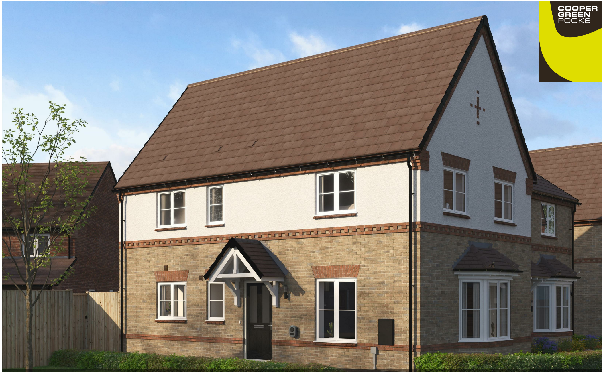
Plot 35, Chesterton, Mytton Oak Manor, Bowbrook, Shrewsbury, SY3 5BT £349,950