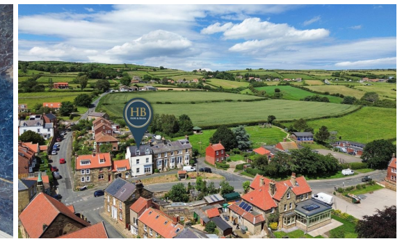
VALE VIEW, FYLINGTHORPE- 4 bed Cottage -£325,000