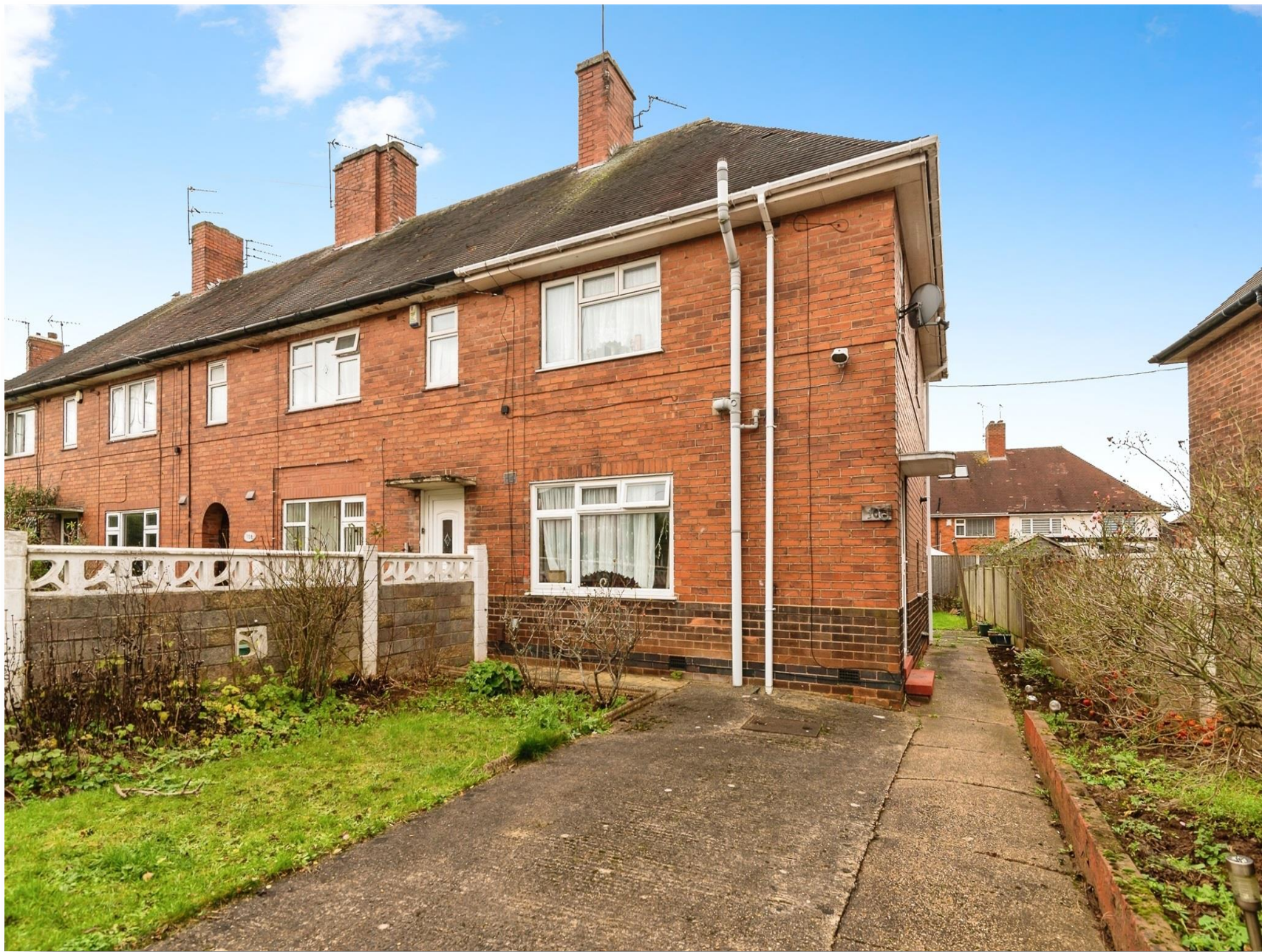
Frinton Road, Nottingham NG8 6GR