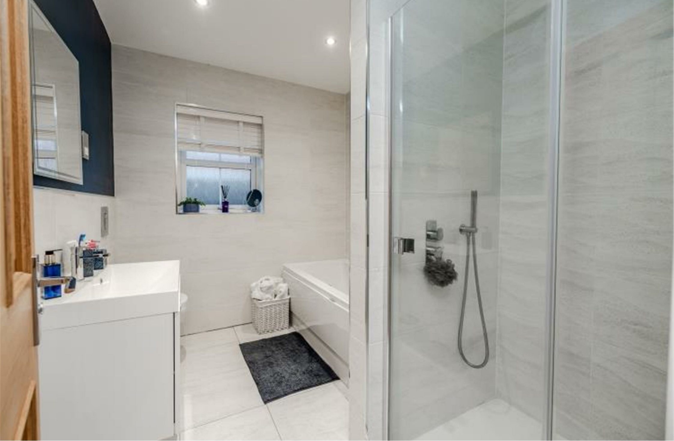
3 Housesteads Mews, Throckley, Newcastle Upon Tyne, NE15 9BX