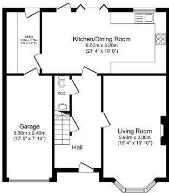
Ground Floor Floor area 71.3 sq.m. (768 sq.ft.)