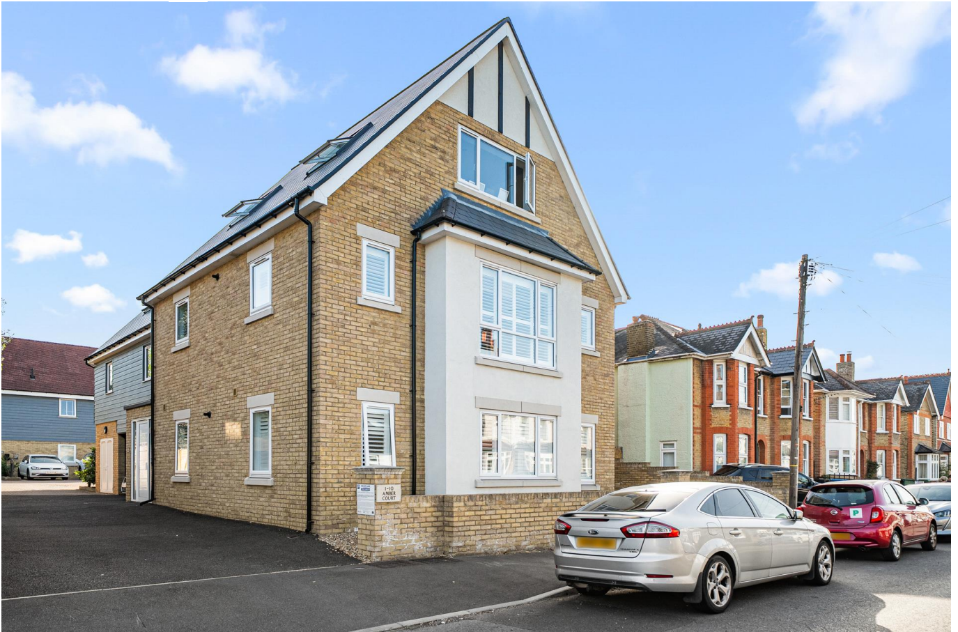
8 Amber Court Annett Road Walton-On-Thames Surrey KT12 2JJ