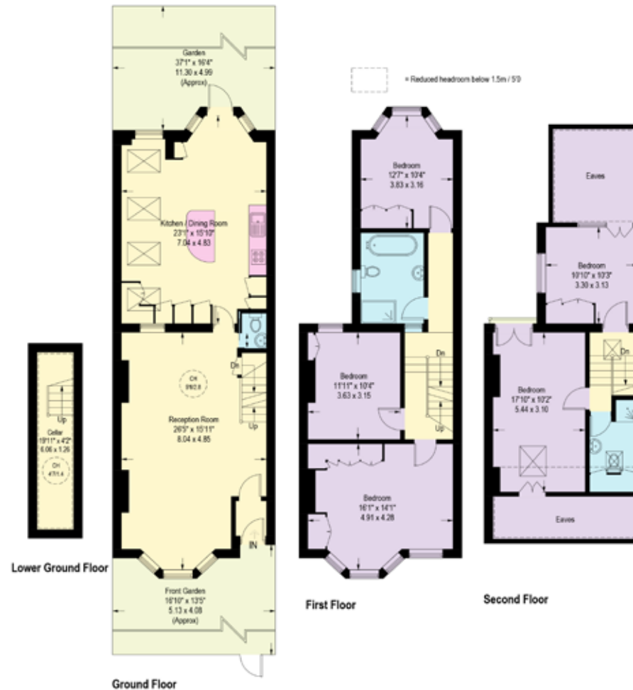
Illustration for identification purposes only. measurements are approximate, not to scale. (ID1287957)

Approximate Gross Internal Area = 166.1 sq m / 1,788 sq ft (Excluding Reduced Headroom/ Eaves) Reduced Headroom/ Eaves = 29 sq m / 312 sq ft Inclusive Total Area = 195.1 sq m / 2,100 sq ft