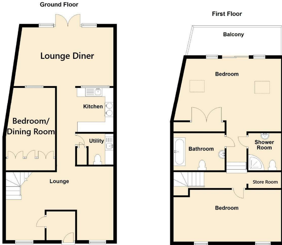
This floor plan is for illustrative purposes only and may not be representative of the property. The measurements are approximate and are for illustrative purposes only. Plan produced using PlanUp.