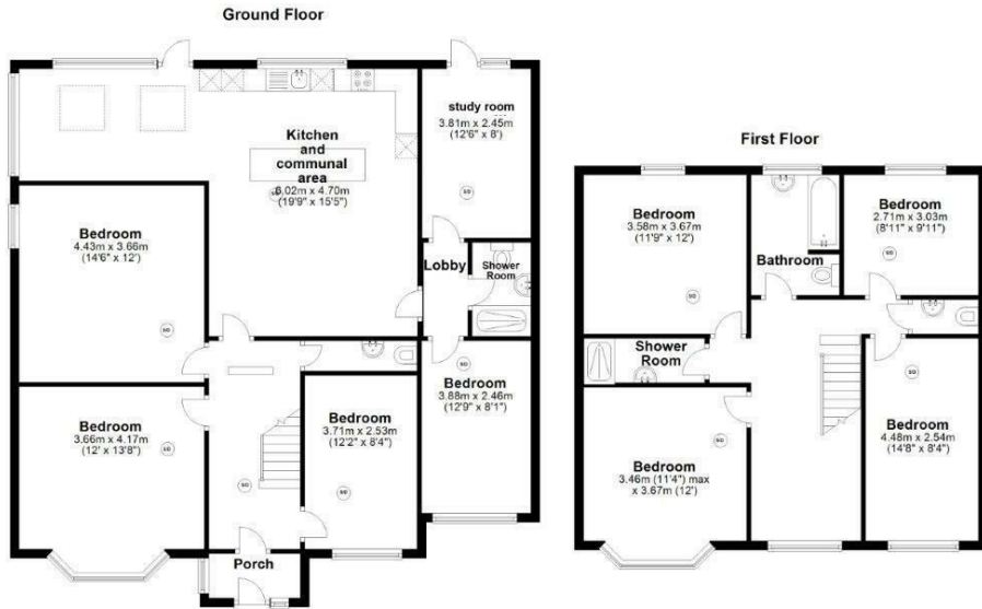
43 Elmdon Road, Birmingham