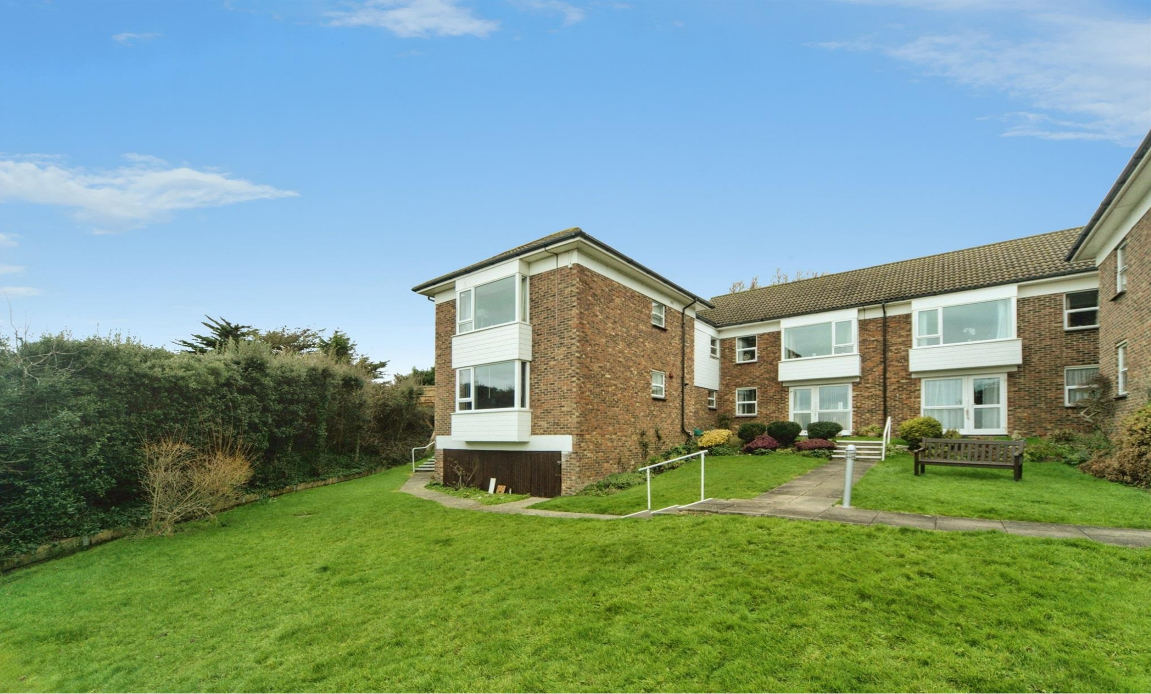
Whitworth House - Buckhurst Road, Bexhill-On-Sea TN40 1UA